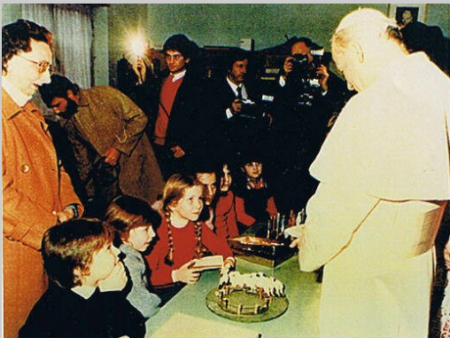
Upon visiting the Atrium, John Paul II declared it “the greatest homily I have ever seen.”